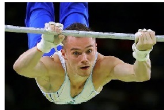
OLEG VERNIAEV (Ucraina) 2015