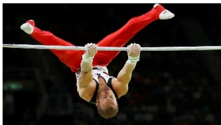
FABIAN HAMBUECHEN (Germania) 2009