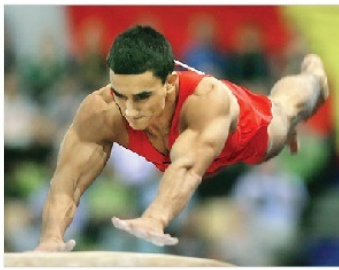
MARIAN DRĂGULESCU (România) 2004